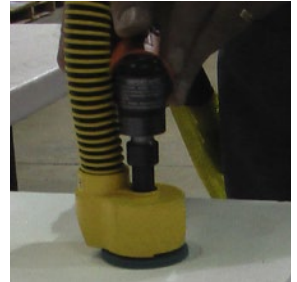
Fig. 1: local exhaust ventilation on tool